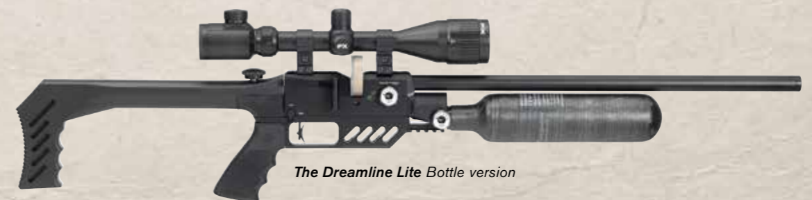
The Dreamline Lite Bottle version