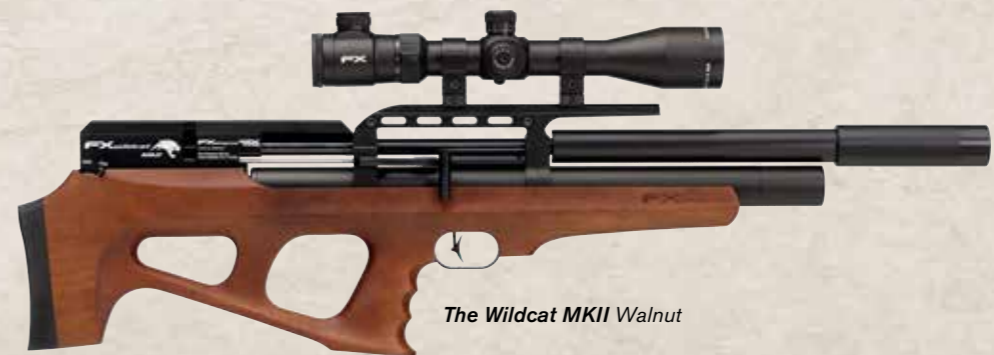
The Wildcat MKII Walnut