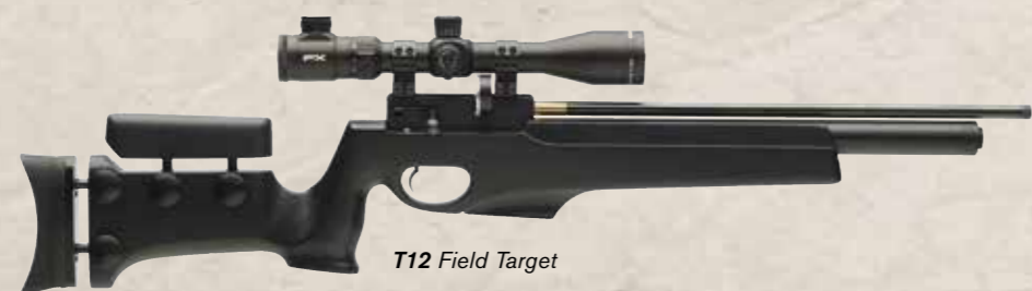
T12 Field Target