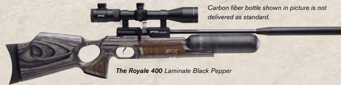
Carbon fiber bottle shown in picture is not delivered as standard.