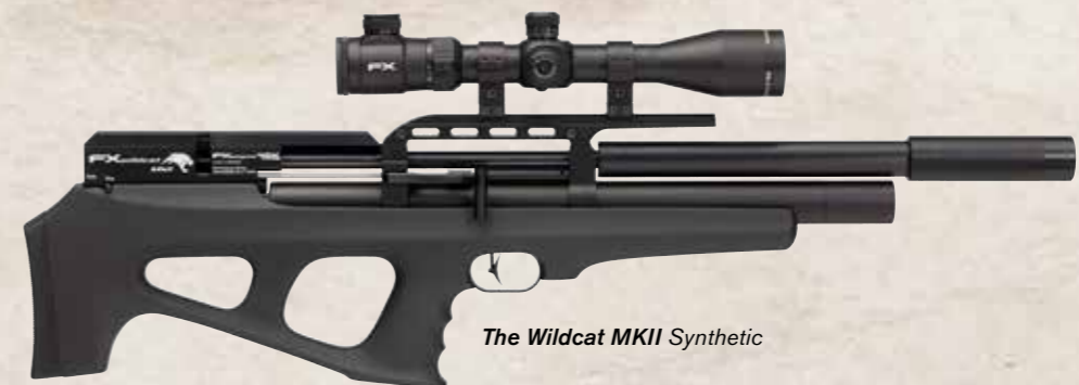
The Wildcat MKII Synthetic