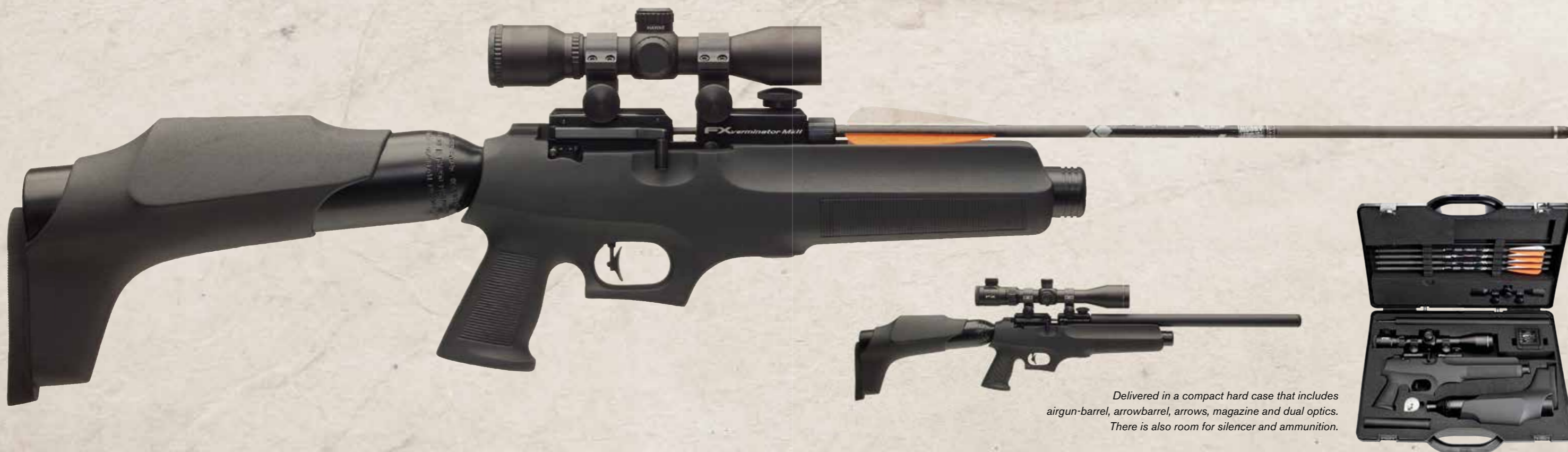
Delivered in a compact hard case that includes airgun-barrel, arrowbarrel, arrows, magazine and dual optics. There is also room for silencer and ammunition.