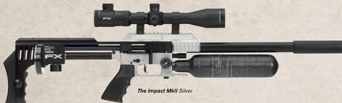
The Impact MkII Silver

Fully regulated with possibilities to change caliber swiftly. Four picatinny rails for easy adapt of accessories. Available in two colors, Standard Black or Silver Edition.