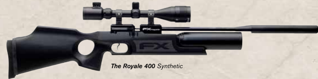
The Royale 400 Synthetic