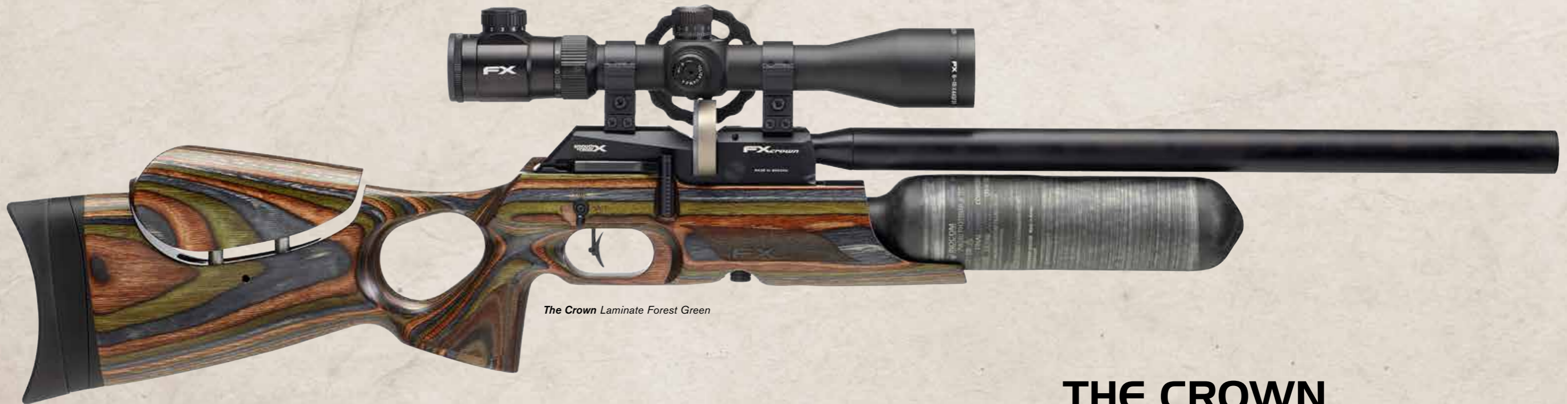
The Crown Laminate Forest Green