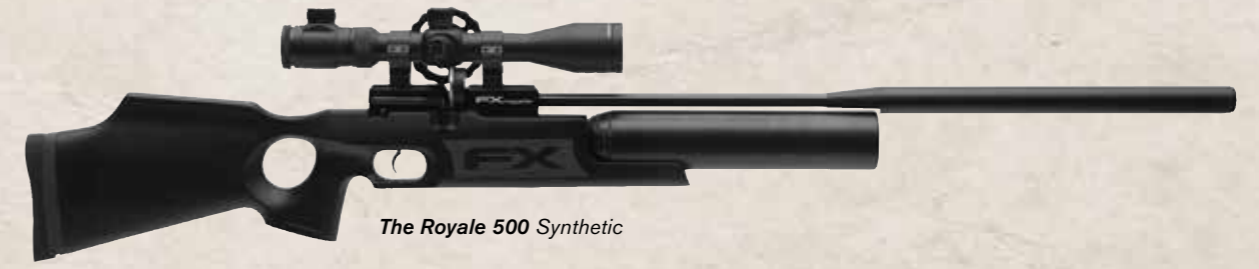
The Royale 500 Synthetic