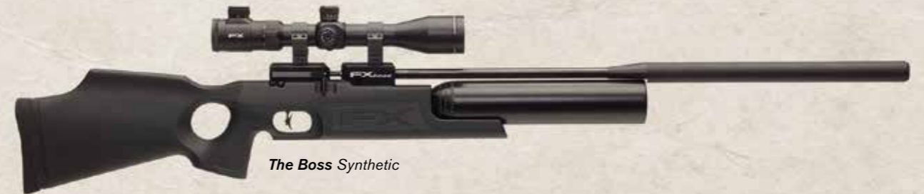
The Boss Synthetic