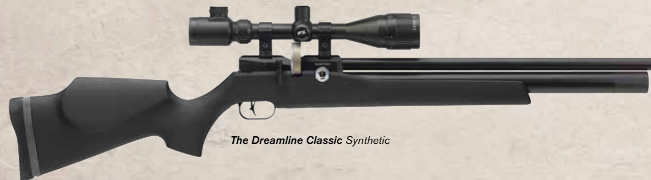
The Dreamline Classic Synthetic