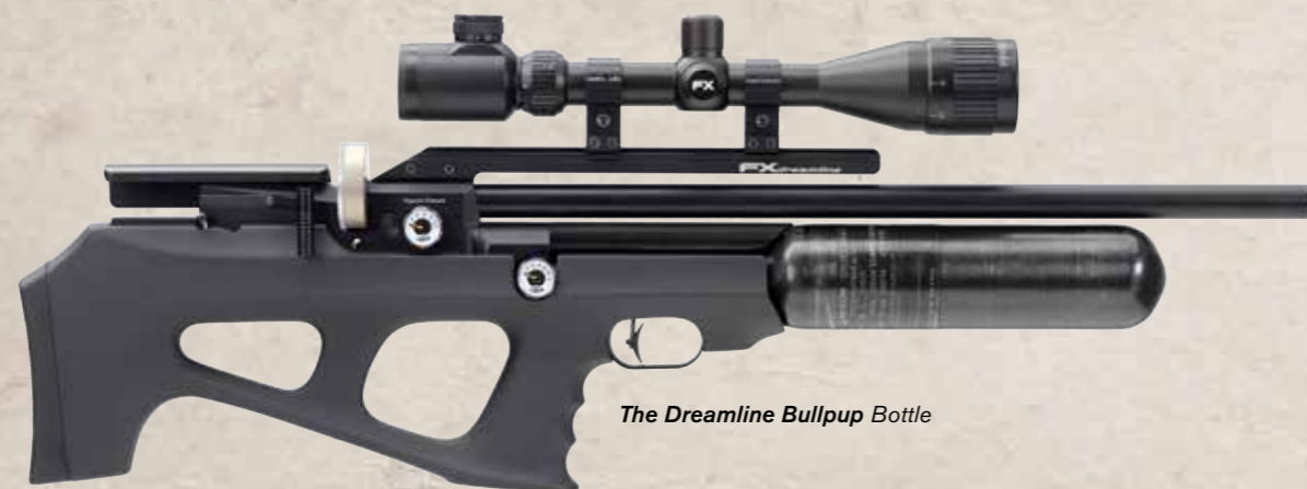
The Dreamline Bullpup Bottle

The Dreamline Bullpup takes the same Dreamline internals of the other models but fits it into a bullpup configuration to shorten the overall. Yet retaining all the adjustability and still utilizing the high capacity magazine of the standard Dreamlines.