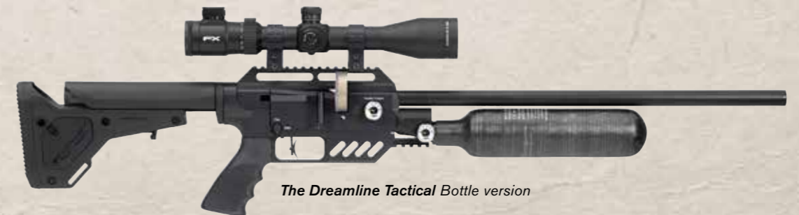
The Dreamline Tactical Bottle version