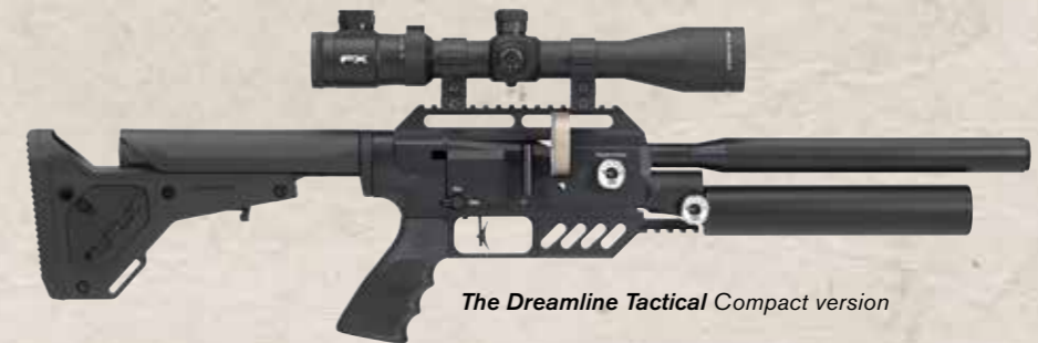
The Dreamline Tactical Compact version

an ultra-packed airgun into a very small package without removing any of the features of the standard Dreamline. Perfect for throwing in a backpack or having ready for that spur of the moment hunting opportunity.