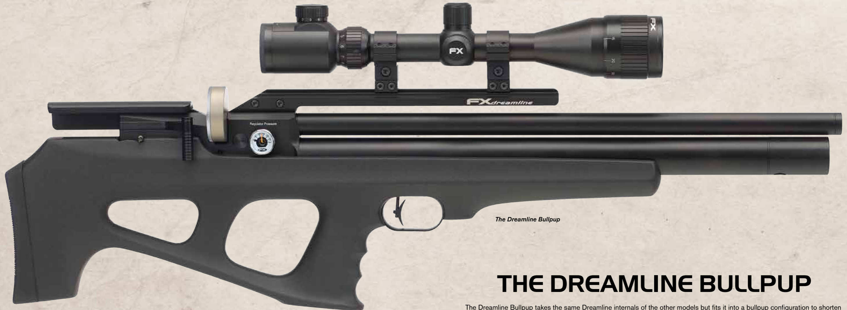
The Dreamline Bullpup