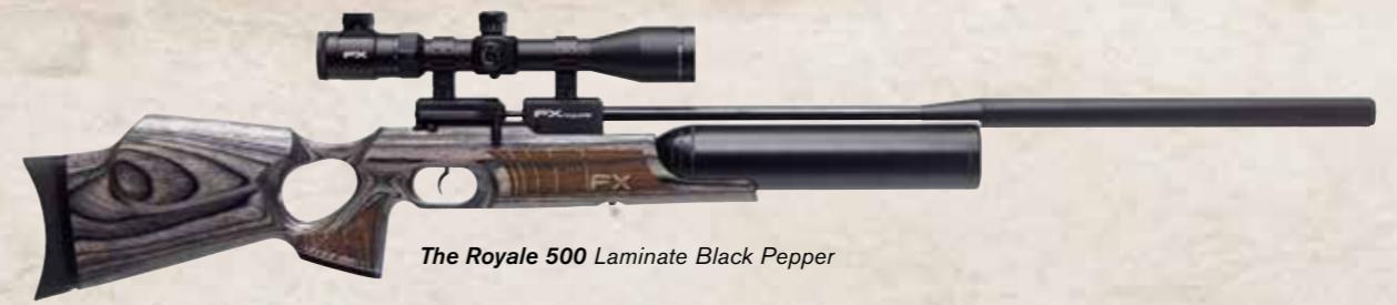
The Royale 500 Laminare Black Pepper