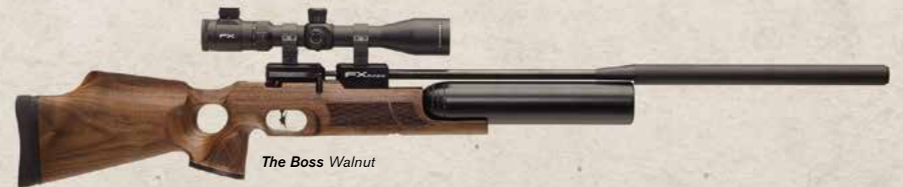
The Boss Walnut