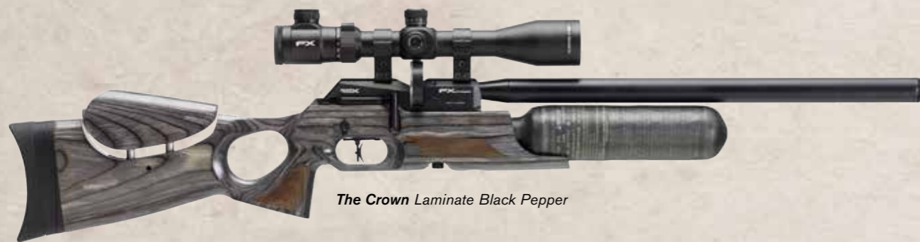
The Crown Laminate Black Pepper

Having already claimed its first competition victory (it was the winning rifle used in the annual 2017 "Extreme Benchrest" competition), the FX Crown is the next generation of airguns and will easily maintain the Royal Gold Standard of KING of all air rifles.