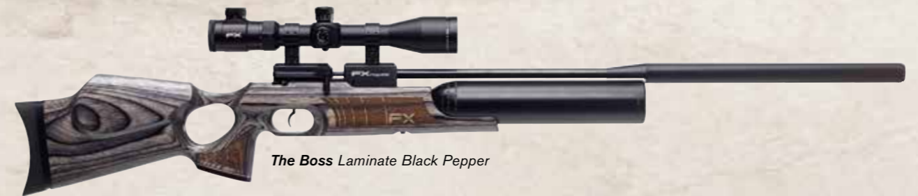
The Boss Laminated Black Pepper