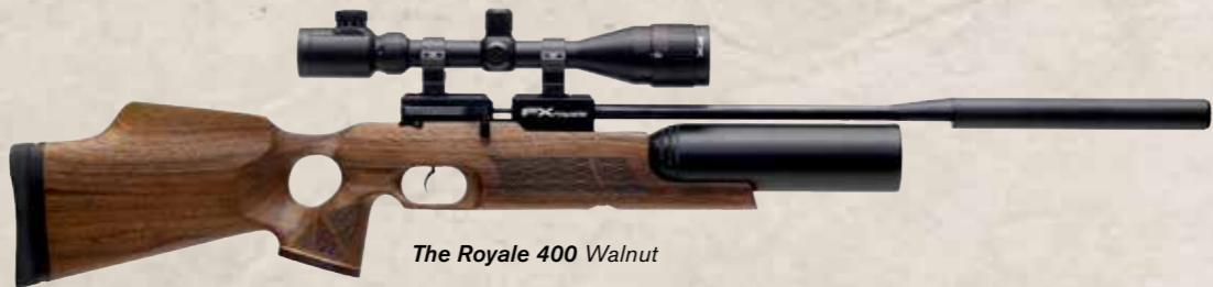
The Royale 400 Walnut