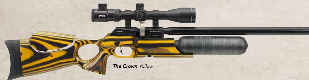
The Crown Yellow