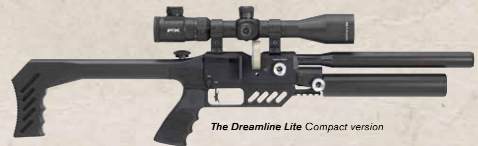
The Dreamline Lite Compact version

provides an ultra-packed airgun into a very small package without removing any of the features of the standard Dreamline. Perfect for throwing in a backpack or having ready for that spur of the moment hunting opportunity.