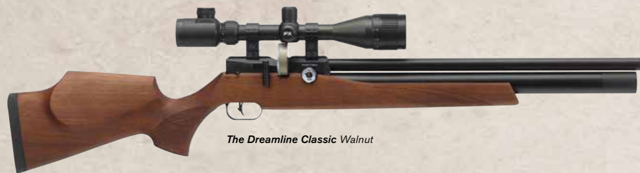
The Dreamline Classic Walnut