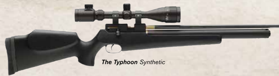
The Typhoon Synthetic

NOTE: Energy stated in the info is maximum possible energy. Due to differences in regulations the rifle might be set to a lower energy, from 7,5 Joule and up. Contact your local dealer for more information.