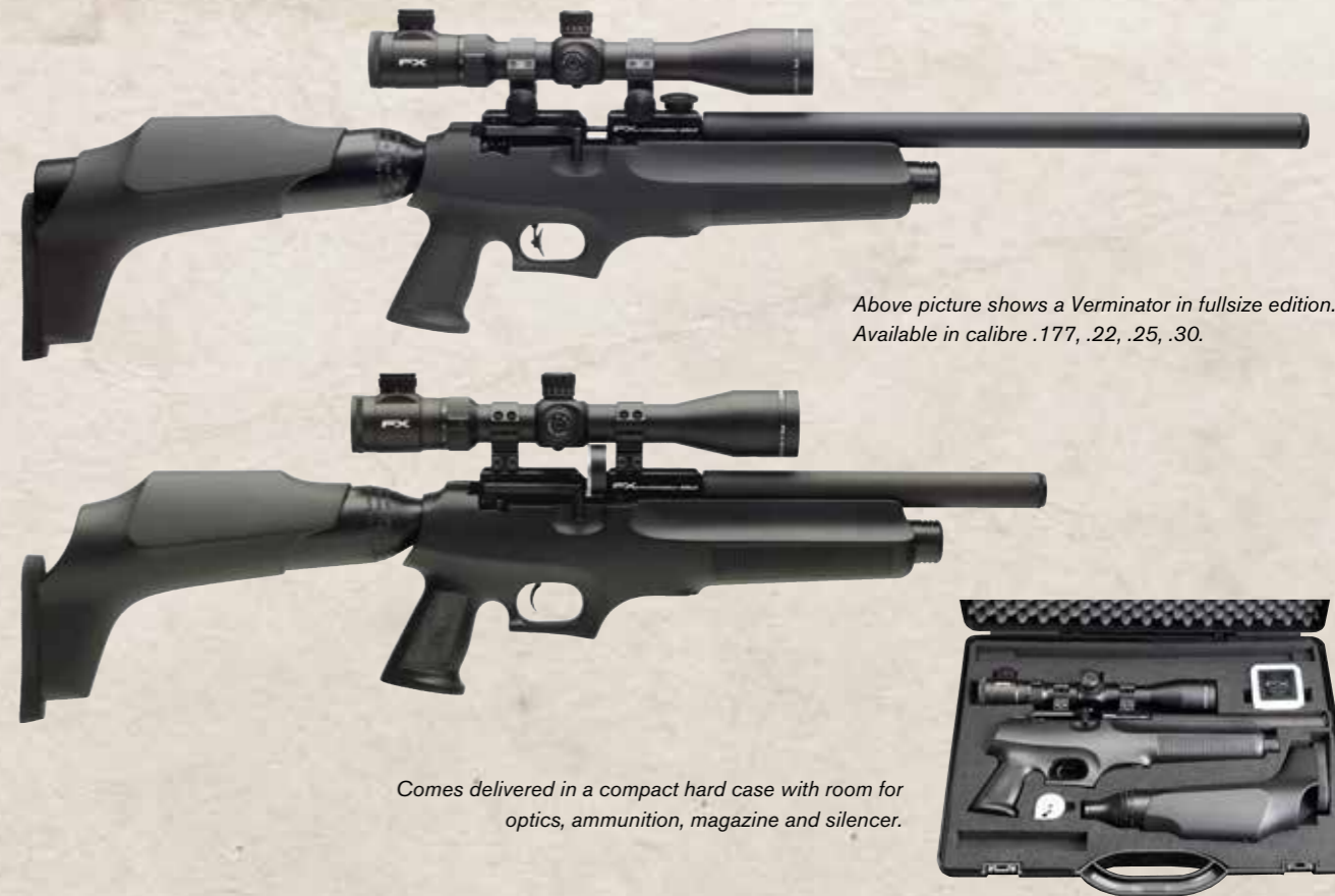
Above picture shows a Verminator in fullsize edition. Available in calibre .177, .22, .25, .30.