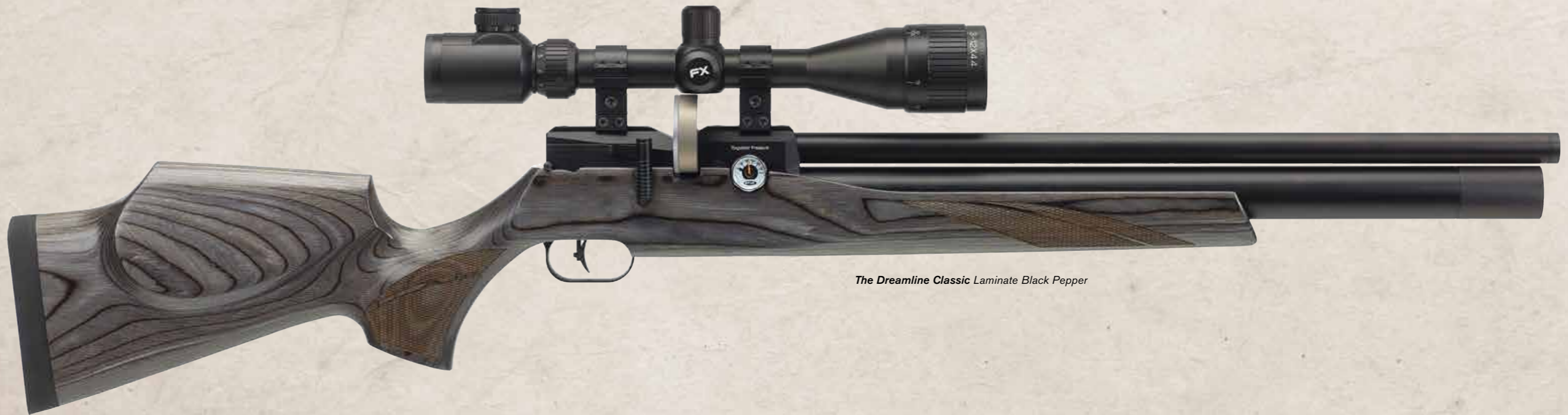
The Dreamline Classic Laminate Black Pepper