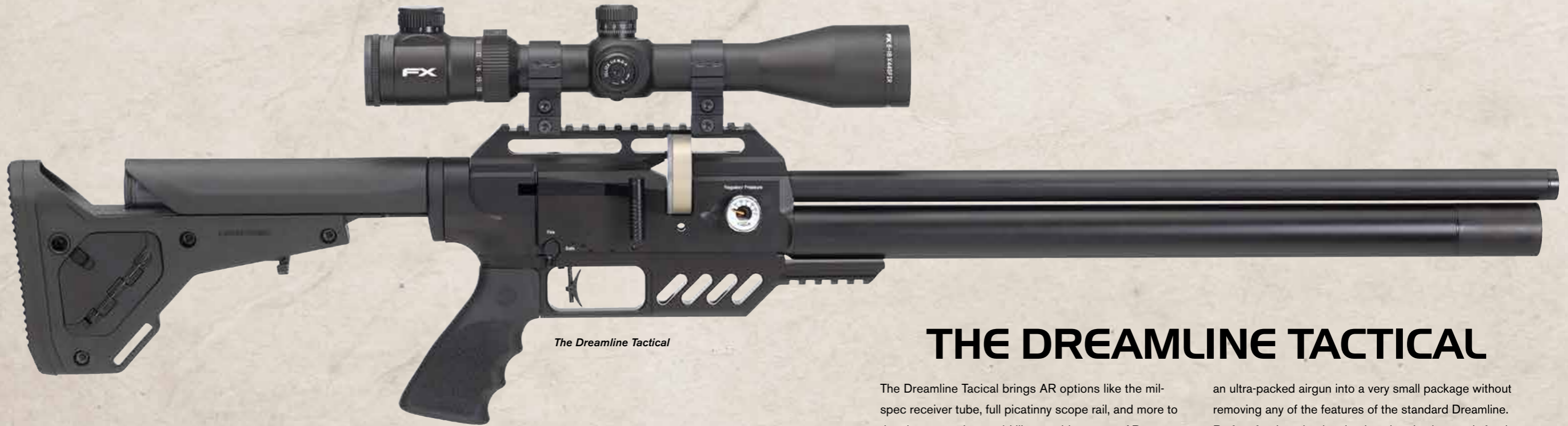
The Dreamline Tactical