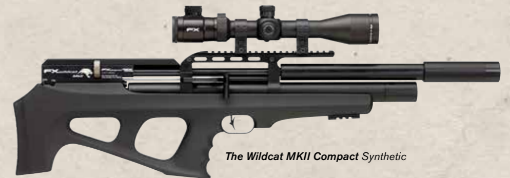
The Wildcat MKII Compact Synthetic