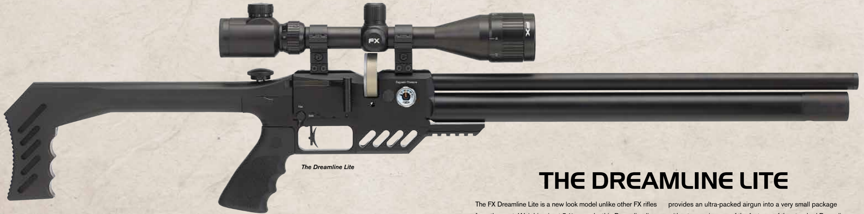
The Dreamline Lite