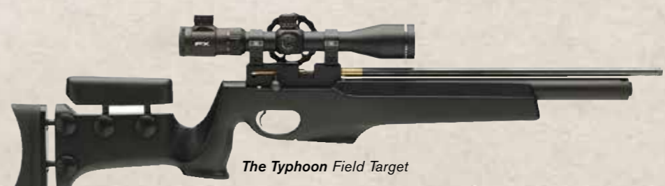
The Typhoon Field Target