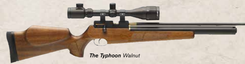
The Typhoon Walnut