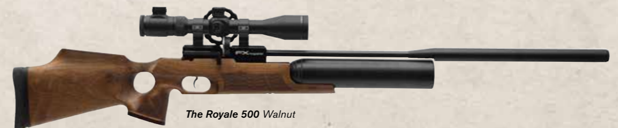
The Royale 500 Walnut