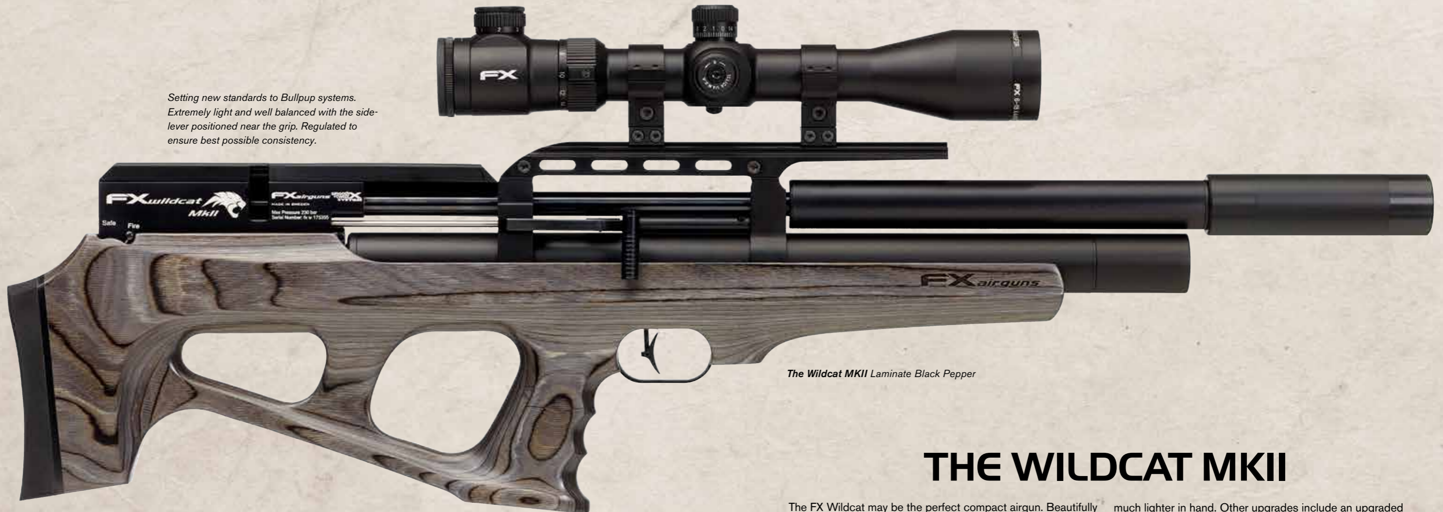
The Wildcat MKII Laminate Black Pepper

Setting new standards to Bullpup systems. Extremely light and well balanced with the side-lever positioned near the grip. Regulated to ensure best possible consistency.