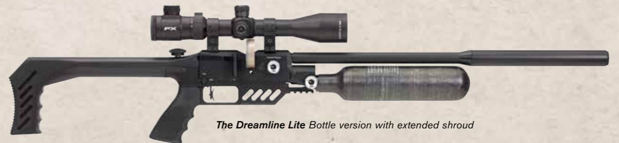
The Dreamline Lite Bottle version with extended shroud