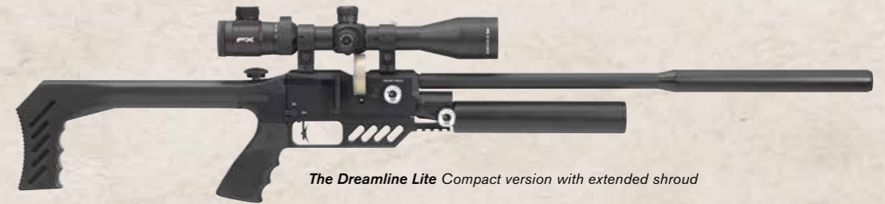
The Dreamline Lite Compact version with extended shroud